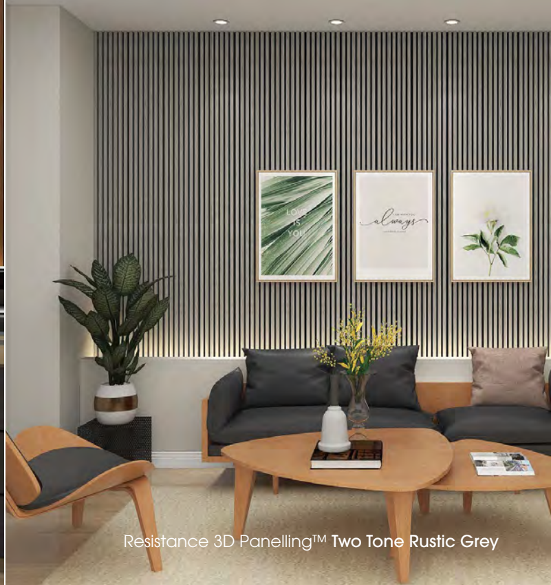
Resistance 3D Panelling™ Two Tone Rustic Grey