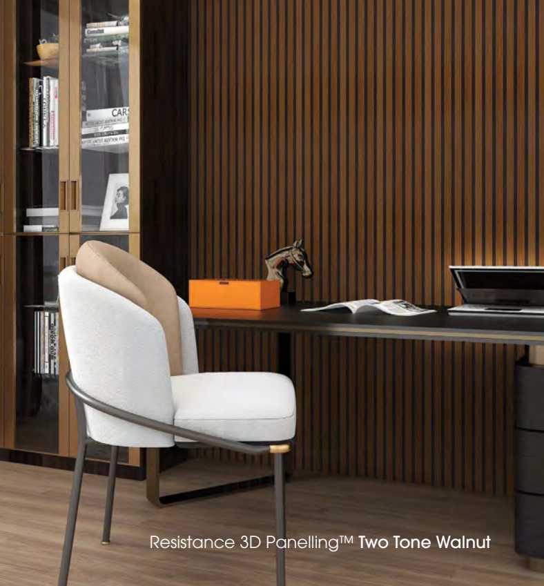
Resistance 3D Panelling™ Two Tone Walnut