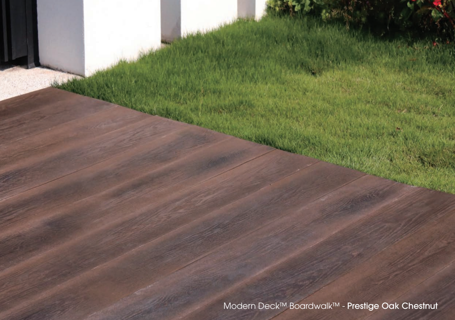
Modern Deck™ Boardwalk™ - Prestige Oak Chestnut