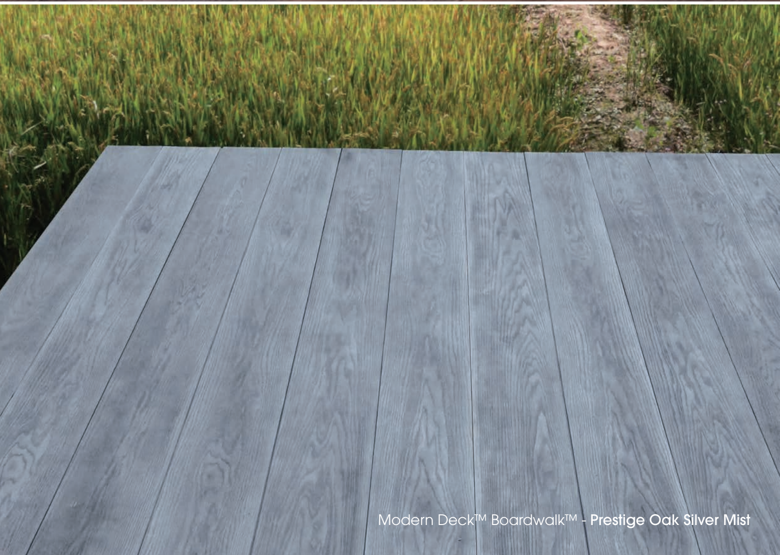
Modern Deck™ Boardwalk™ - Prestige Oak Silver Mist